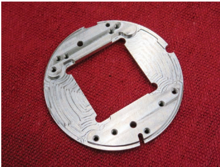
Precision machined component for defense industry.

Crucial Component Machining LLC offers CNC machining, Swiss screw machining and CNC turn mill machin-