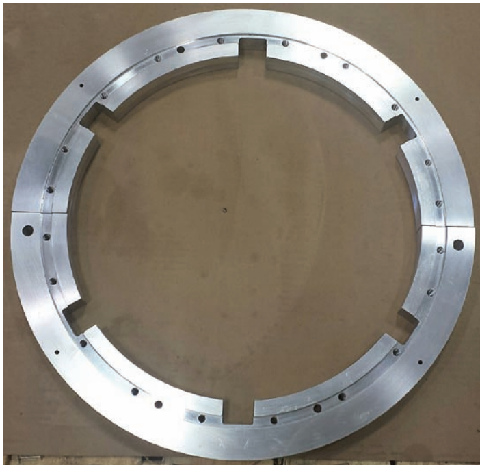
(left) Finished workpiece, a clam cutter, when it leaves the 800iLTGA. The clam cutter is 30" in diameter.

330-706-0700 info@wagnermachine.com www.wagnermachine.com