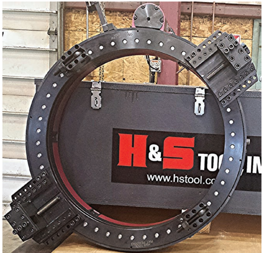
A completed clam cutter. Wagner Machinery manufactures 80% of the component parts which are sent to H & S Tool, Inc. for assembly.